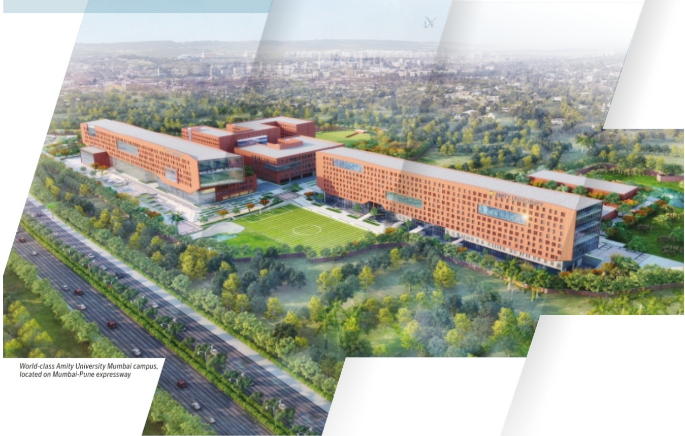
World-class Amity University Mumbai campus, located on Mumbai-Pune expressway