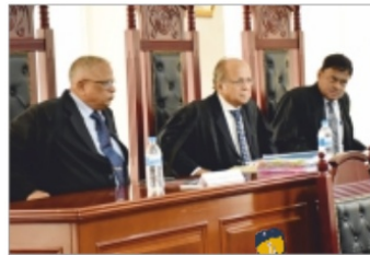
Justice Ambadas Joshi (Retd.), Bombay High Court; Justice Asok K. Ganguly (Retd.), Supreme Court; Justice Sandeep K Shinde (sitting Judge) Bombay High Court shared valuable insights with students at Amity University Mumbai