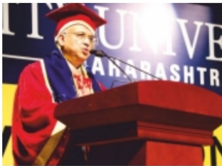
Shri Dilip Shanghvi – MD, Sun Pharma Ltd. sharing words of wisdom with the students of Amity University Mumbai

Be part of a university renowned for extensive industry interaction. At Amity University Mumbai students interact with several CEOs & Global Gurus through unique modules such as CEO Dinner Series, CEO's Forum etc., wherein industry leaders, top professionals, entrepreneurs, policy makers and global gurus share their wisdom, insights and experiences, thereby facilitating practical learning for you.